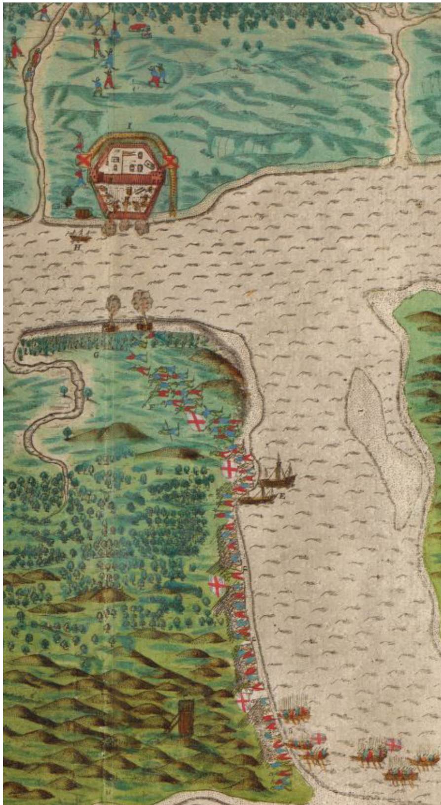
Detail of landing party and attack on the Spanish Fort