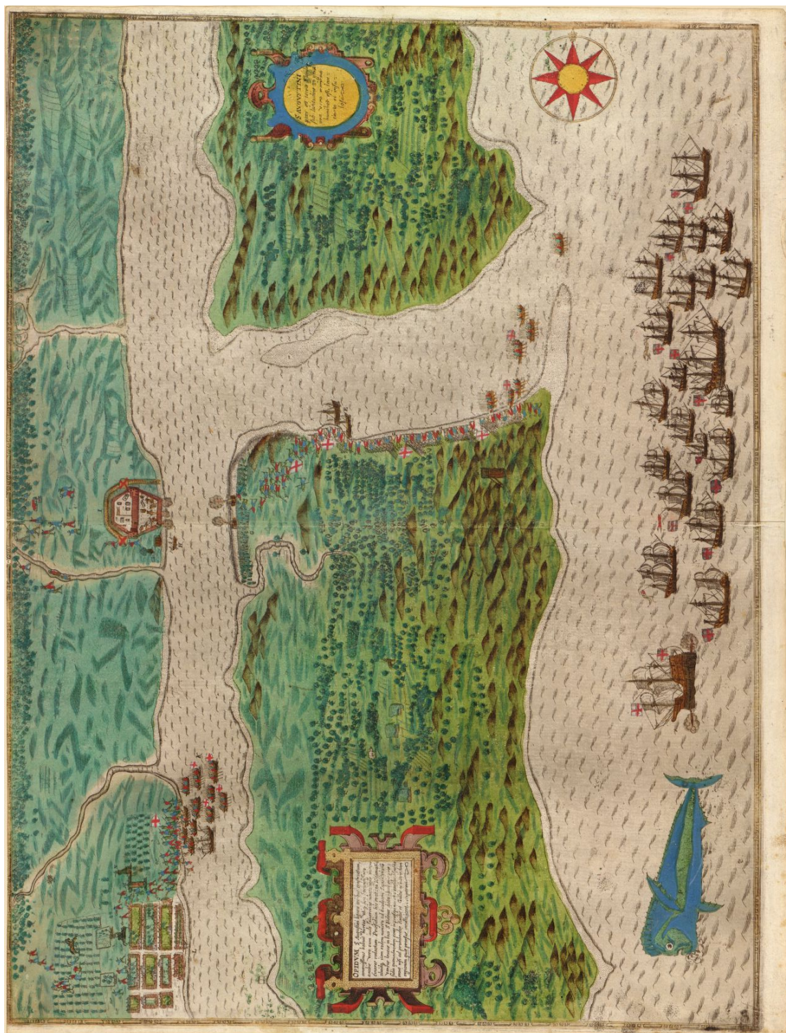
Baptista Boazio, St. Augustine, 1588–1589.